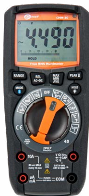
CMM-30 Industrial multimeter