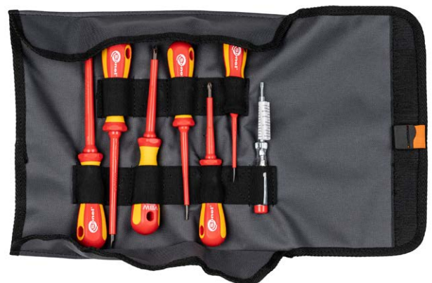
NZ-2 Screwdriver set, 6-pieces + voltage tester