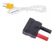
Temperature measurement Probe (K-type) WASONTEMK Adapter WAADATEMK