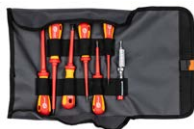
NZ-2 set WNZ2