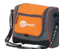
M-6 carrying case WAFUTM6